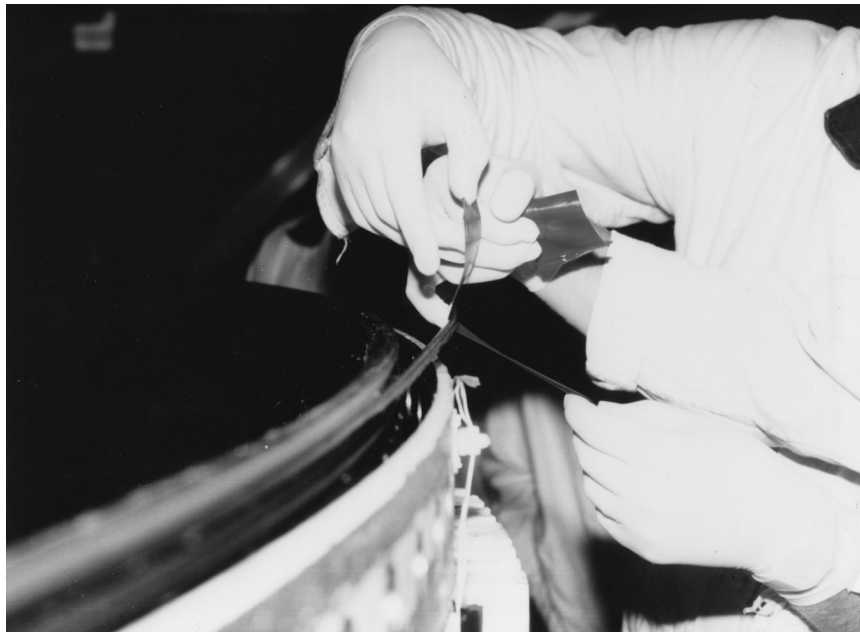
Figure 2 A risk-taking culture. This 1985 photo, which I found at the NASA Photo Archives, Washington DC, show two NASA technicians dressed in surgical scrubs using antiseptic tape to inspect and place an O-ring in its groove in a Solid Rocket Booster joint.